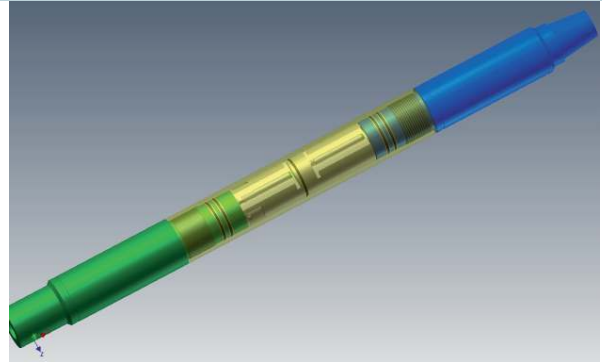
3D-view of a dual gauge flow measurement in a Venturi Mandrel

Measurement range depends on allowed restriction diameter.